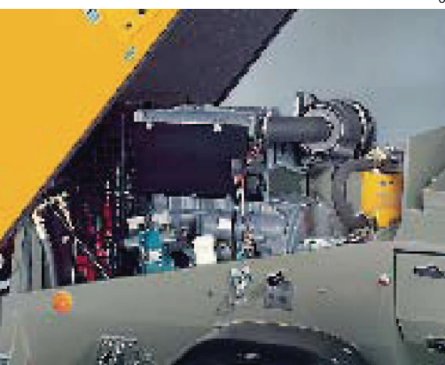
This is the source of all the power: the diesel engine with an impressive 32.8 kW of power.