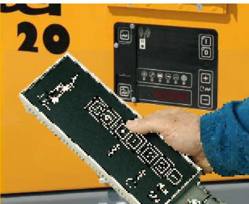
You can operate the SP 20 entirely from one side, or using the convenient radio remote control.