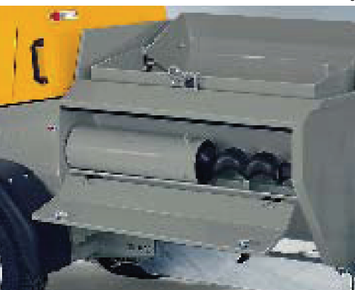
Practical: here you can store tools or a rotor/ stator.