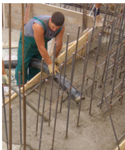
The P 718 conveys fine concrete up to a grain size of 32 mm, among other things.

This makes the P 718 an unbelievably versatile fine concrete pump that can be used when space is limited on the construction site.