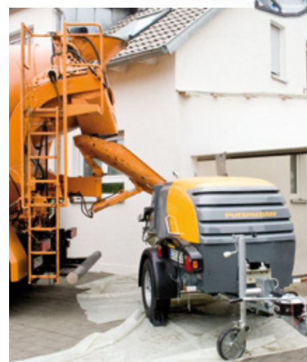
Truck mixers have ideal access to the large hopper.