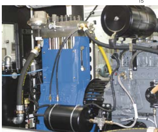
The high-pressure pump is installed in an upright position, thus saving considerable space.