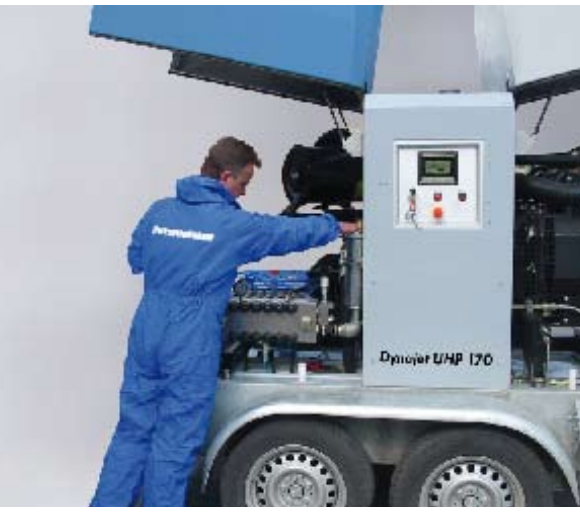
With the operating and service covers, which can be opened very wide, you can reach all the important parts with no problem.

A control device ensures that, in the case of an overload, caused by the wrong nozzle choice for instance, there is only a slight rise in pressure and load on the system.