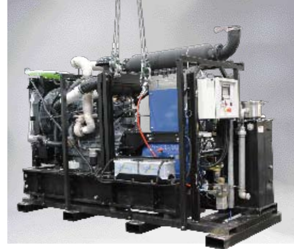
The installation version of the maximum-pressure unit Dynajet UHP 250 (without soundproofing cover is mounted on a support frame).

Units of the 250 hp class are very flexible when it comes to their different uses. They can supply either one bulk consumer or two (or more) workplaces at the same time - all without a hitch.