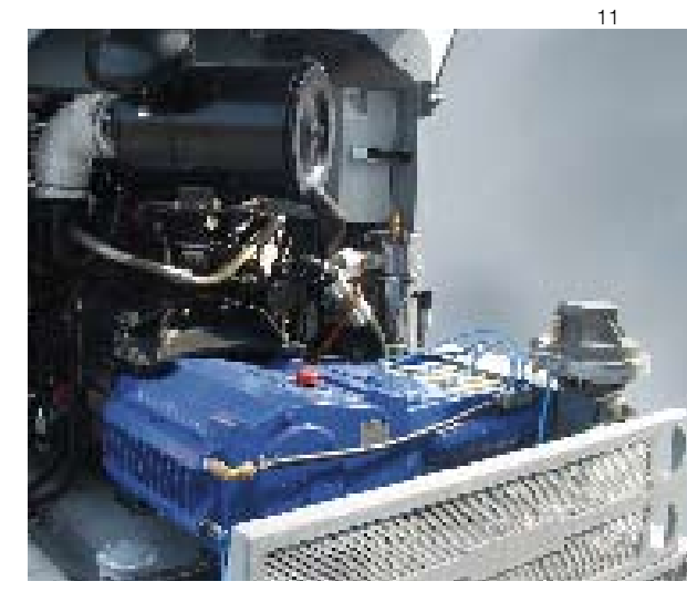
The horizontal design of the robust triplex-plunger high-pressure pump saves space and quaranties, easy service and maintenance work.