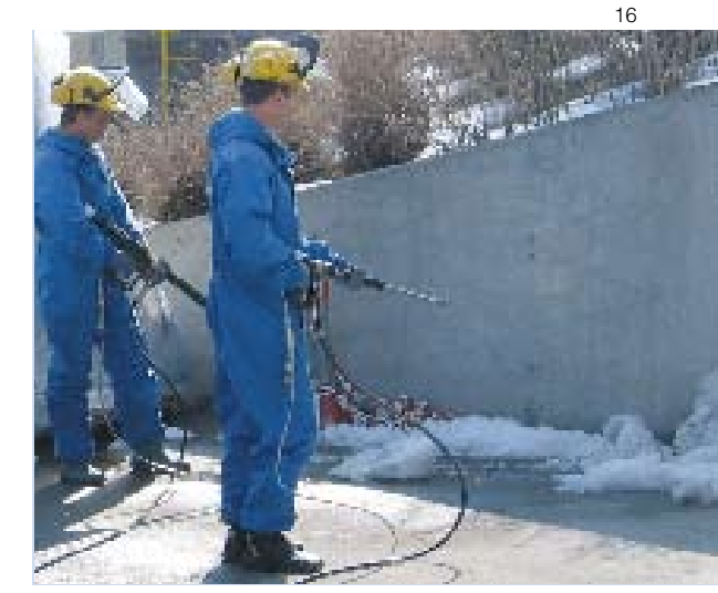
With such output, even 2 (or more) workplaces can be provided with sufficient power

By means of special exchange sets (optional), you can change the output data fast and easily. This allows you,