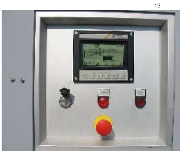
Easy control system with convenient automatic pressure/ speed control (manual operation is optional).